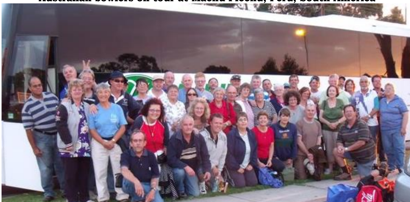
Tour day, Frankston. VIC