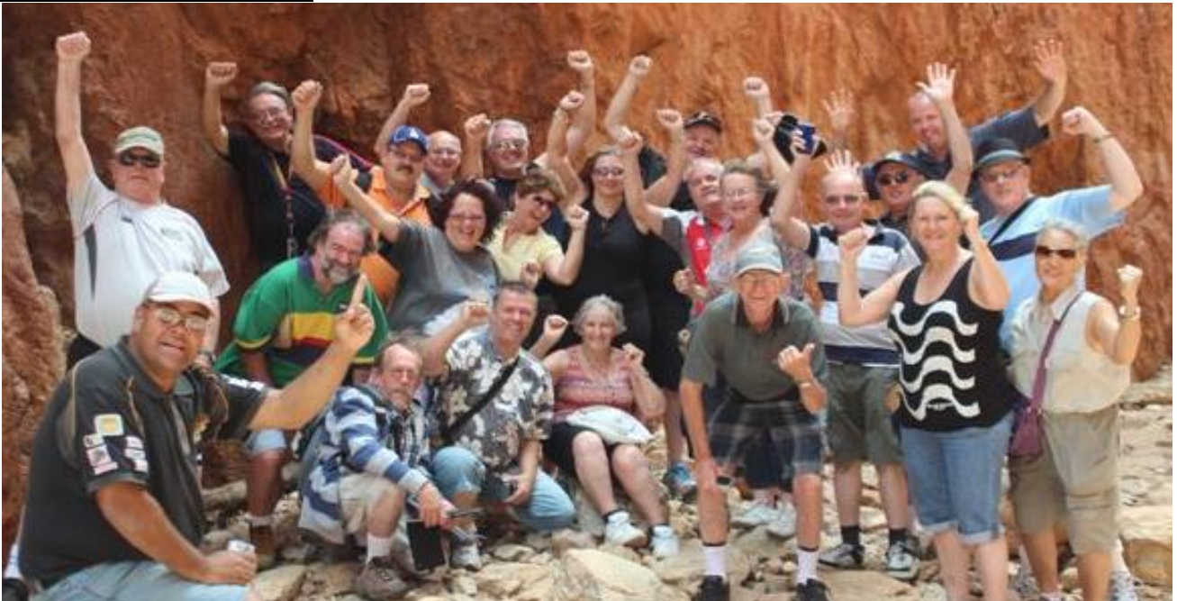
Alice Springs, Northern Territory 2012