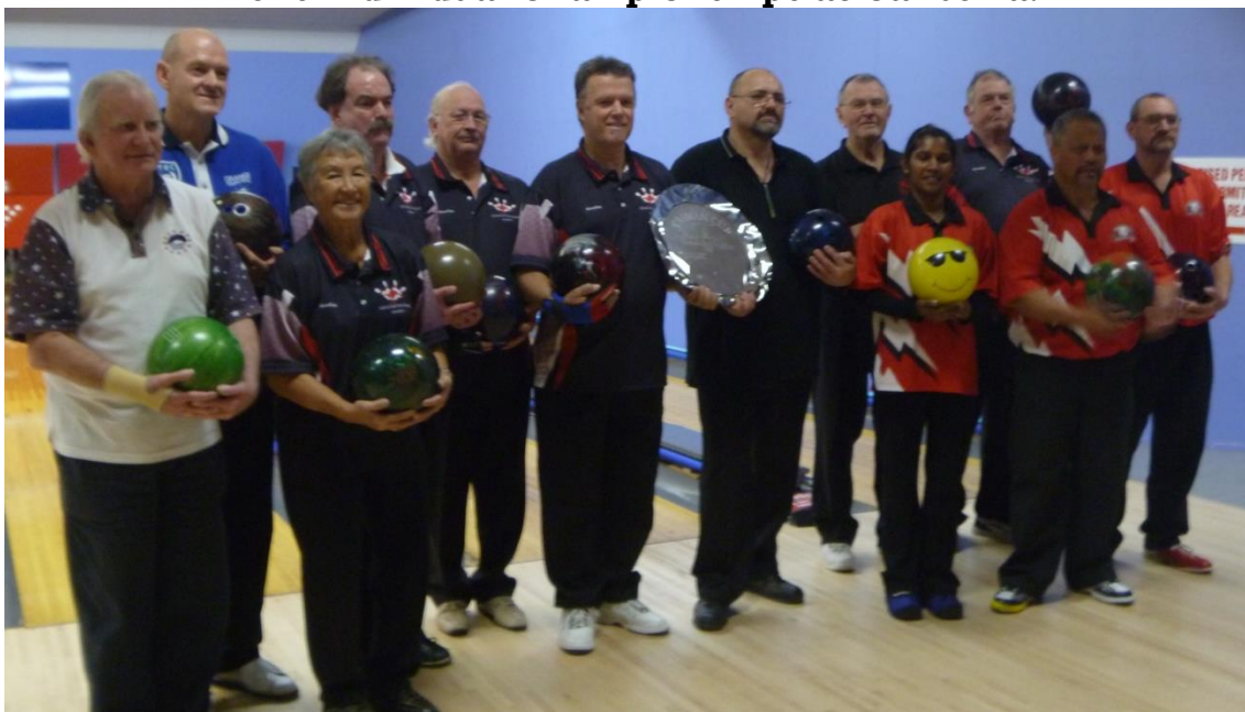
Australian and New Zealander for Tasman Cup at Dunedin, NZ