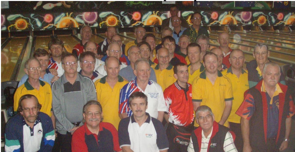
Men Individual Championships bowlers