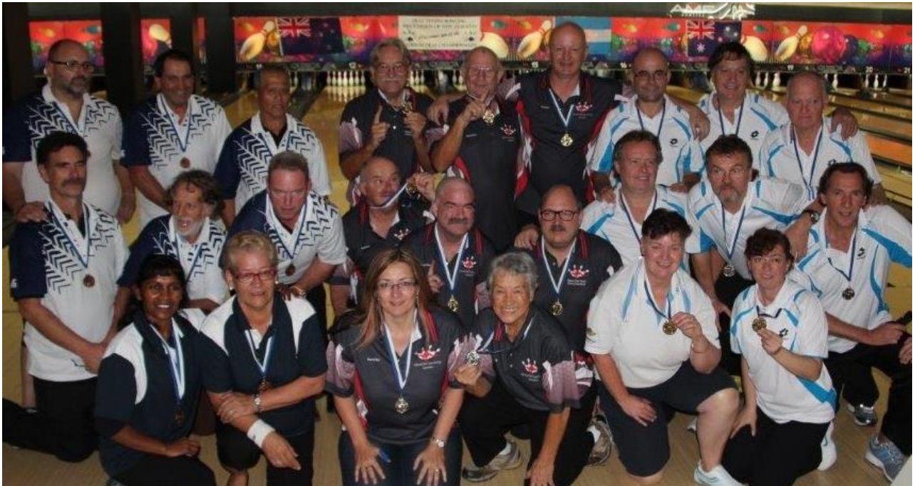
New Zealand, Australian & Argentines Team at Auckland, NZ