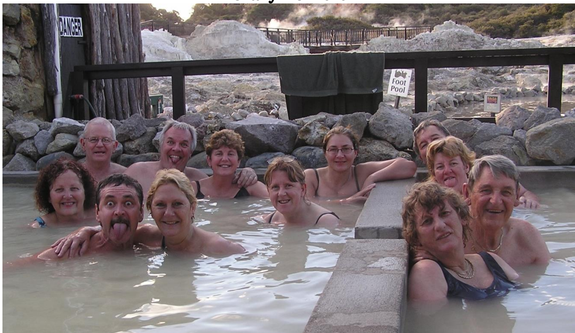
Mud Bath at Rotoura, NZ