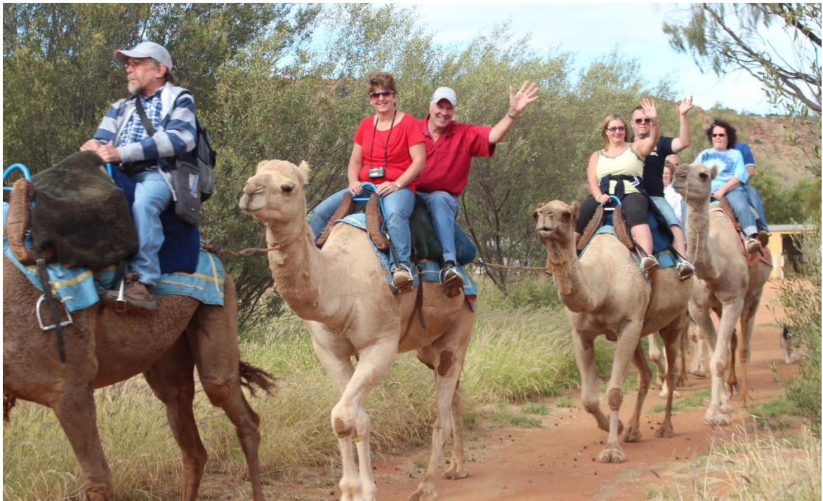
Another Camel ride at Alice Springs