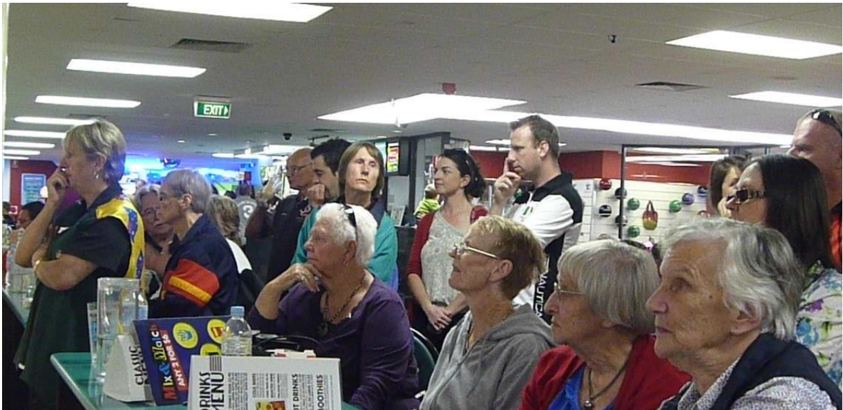
Spectators at Tenpin Centre