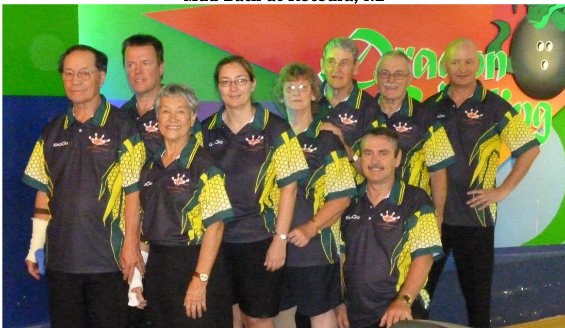
Australian Bowlers at Buena Aires, Argentina, South America.