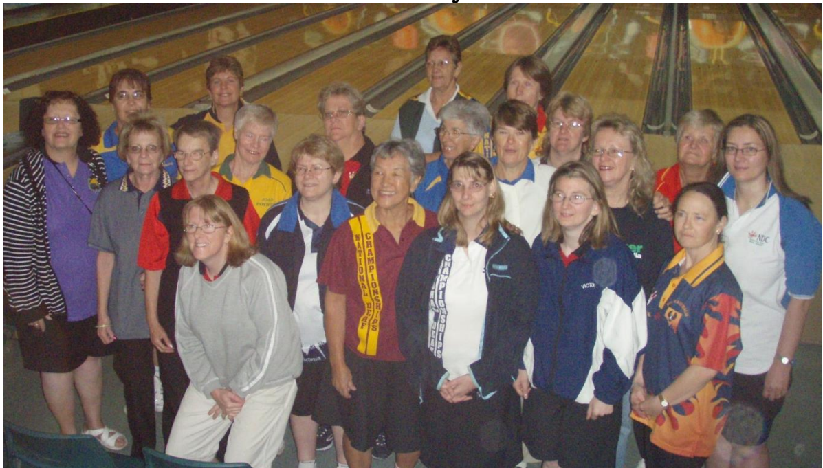
Womens Individual Championships bowlers