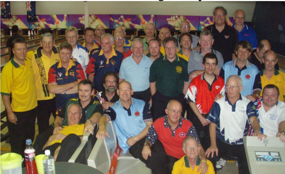
Men Individual Championships bowlers