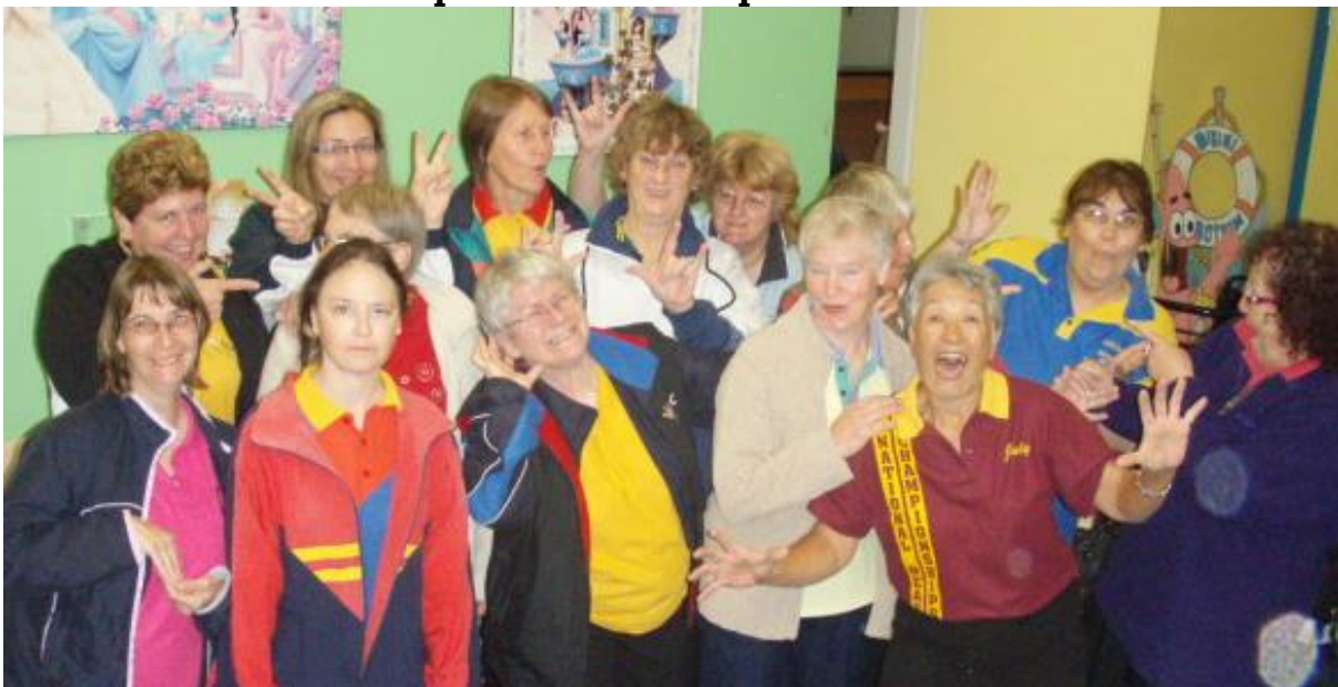
Womens Individual Championships bowlers