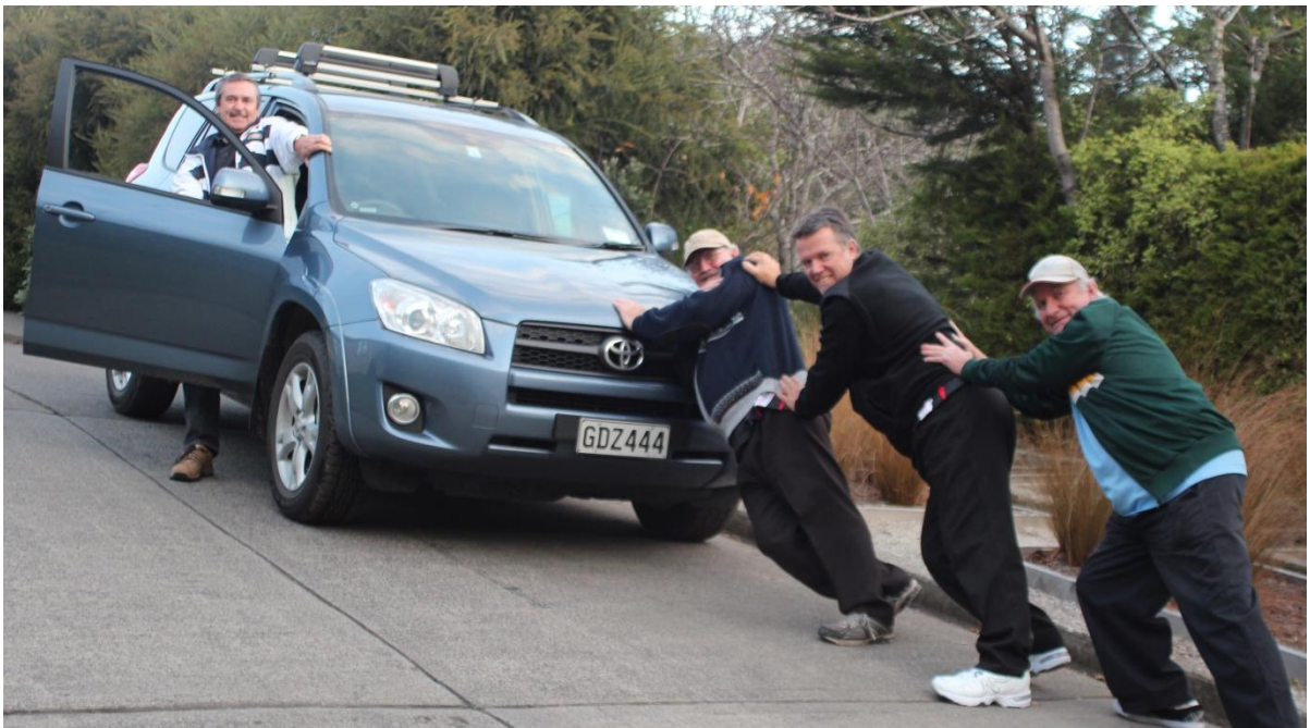
Stop the car rolling down steeping street in the world – Dunedin, NZ