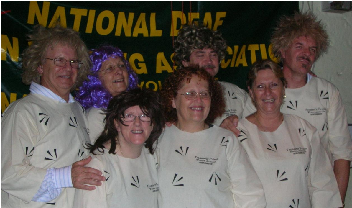
Convicted Board Directors, Perth