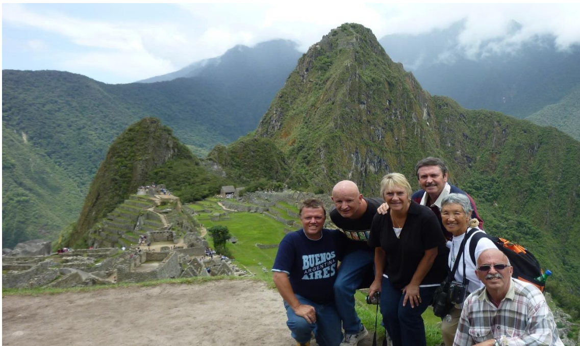
Australian bowlers on tour at Machu Picchu, Peru, South America