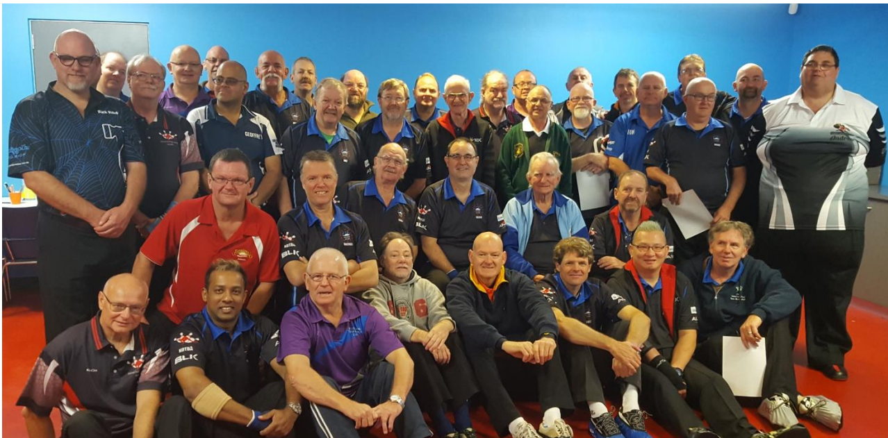
Mens Individual Championships at Canberra.