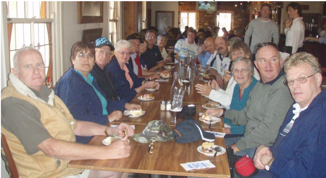
Lunch time during tour trip