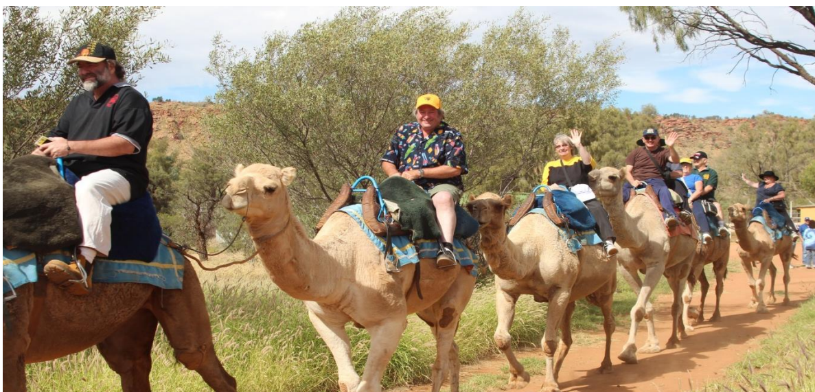
Camel ride at Alice Springs