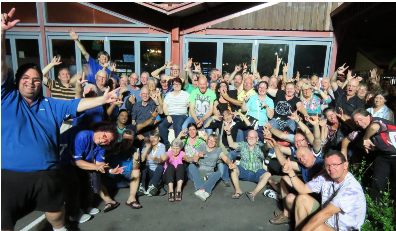
Full Moon Crazy at Warners Bay, NSW