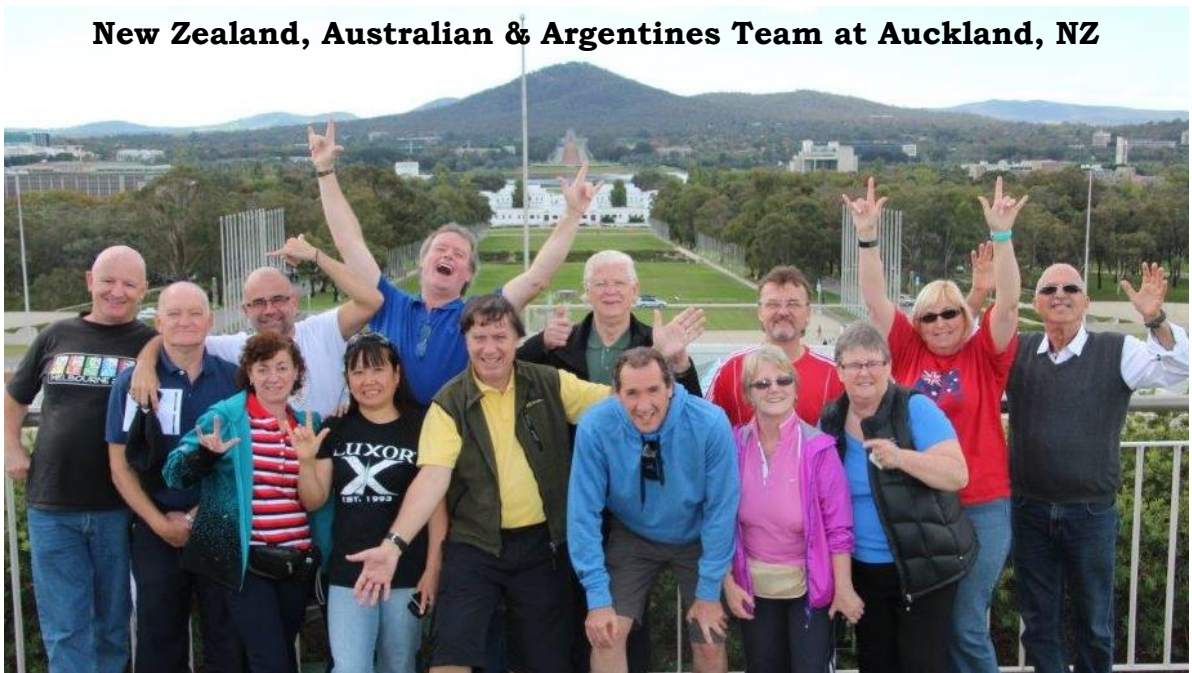
Argentina team on Tour at Canberra