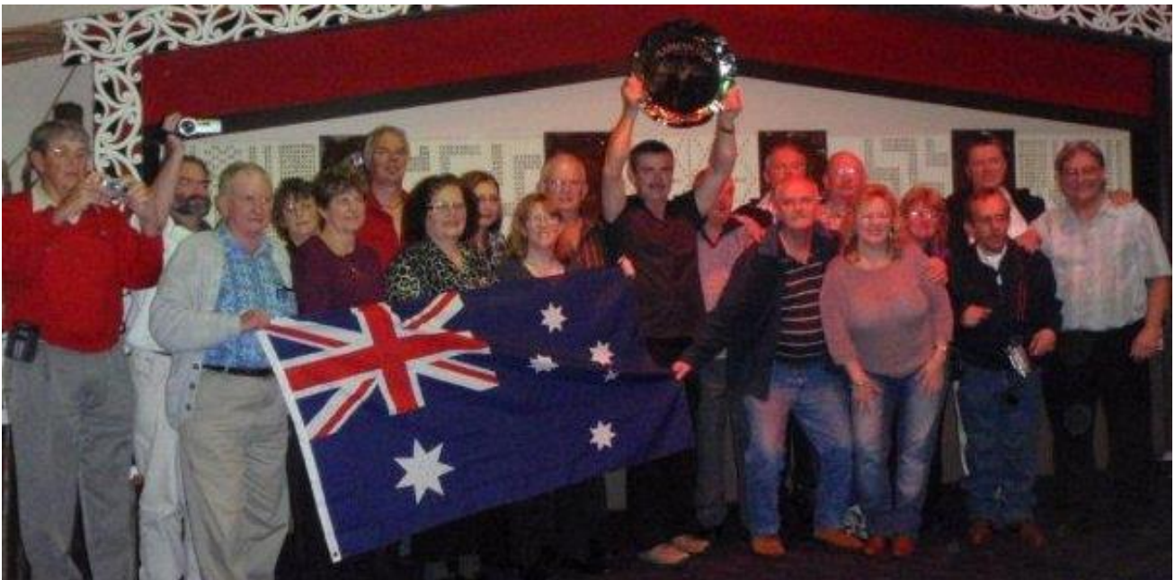
Tasman Cup Champions, Rotorua, NZ 2010